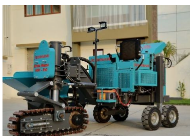
Kerb paver machine (01 Nos)