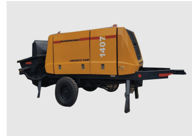
Concrete Pump(02 Nos)