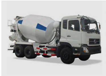
Transist Mixer(12 Nos)