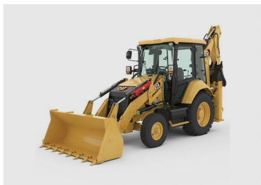
Backhoe Loader (04 Nos)