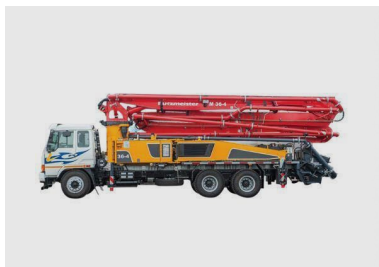
Boom Pressure (01 Nos)