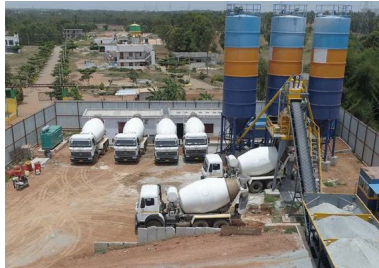
RMC Plant(03 NOS)

A small river named Duden flows by their place and supplies it with the necessary regelialia. It is a paradise